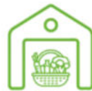
Food Contact products