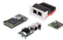
3 PC cards