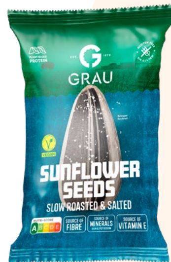
Sunflower Seeds Slow Roasted & Salted Origin: ARGENTINA