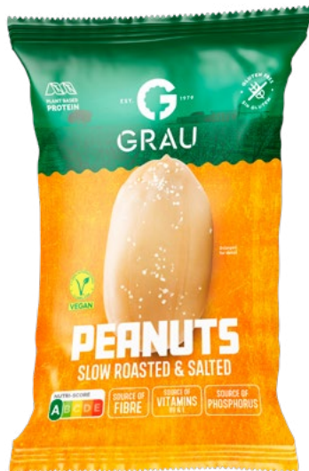
Peanuts Slow Roasted & Salted Origin: CHINA

At Grau, we believe that the real heroes are the ones who take the right next step and make the best small decision. We know that every moment is an opportunity for greatness. With our delicious and nutritious snacks, we take you there.