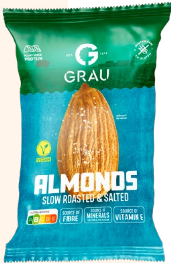
Almonds Slow Roasted & Salted Origin: USA & SPAIN