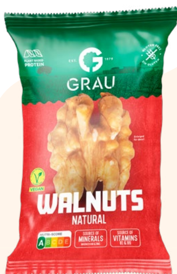
Walnuts Natural Origin: SPAIN