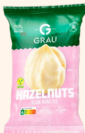
Hazelnuts Slow Roasted & Salted Origin: TURKEY & GEORGIA