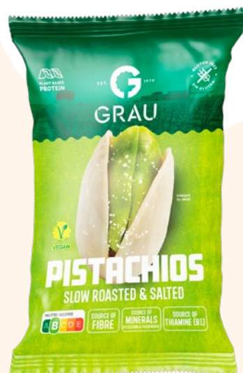
Pistachios Slow Roasted & Salted Origin: IRAN & USA