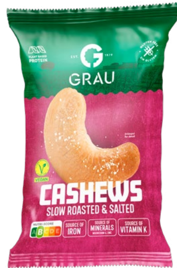
Cashews Slow Roasted & Salted Origin: VIETNAM