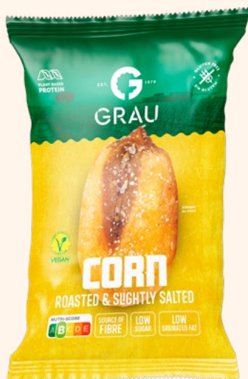
Roasted Corn Roasted & Slightly Salted Origin: SPAIN