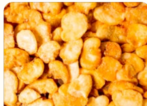
Roasted Broad Beans